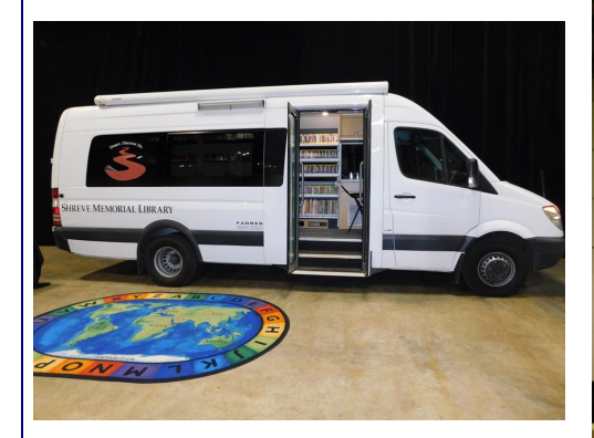
At events, the Rotary Learning Bus, the Shreve Memorial Book-Mobile and the Food Bank vehicle will be on-site along with set up and the various activities.

Ribbon cutting and media opportunity to be held at our first event! Date to be announced.